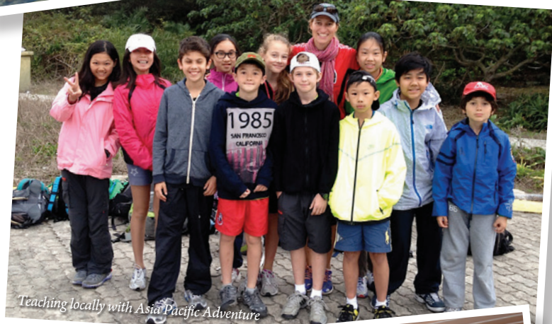
Teaching locally with Asia Pacific Adventure