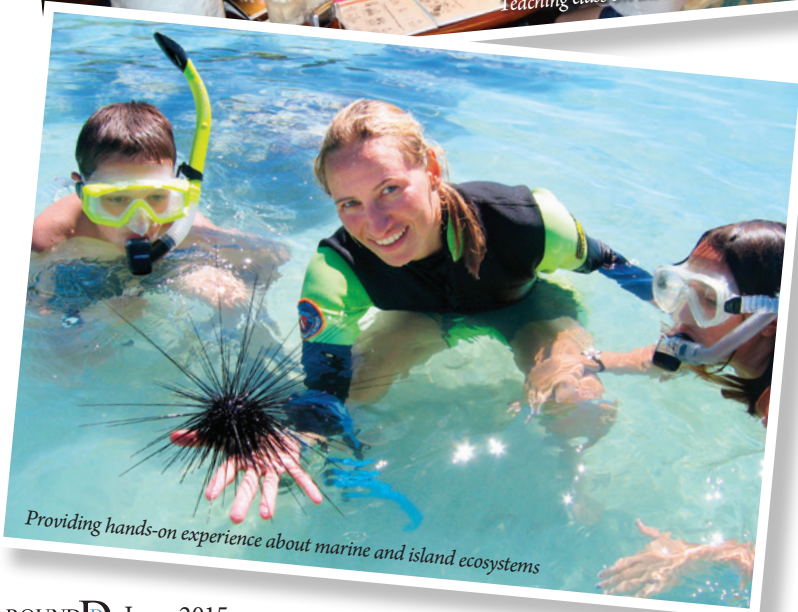
Providing hands-on experience about marine and island ecosystems

sharks and other animals that live on the coral reef. Oh and did I mention she's teaching children too?