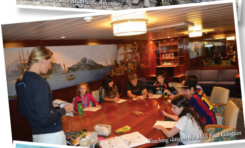
Teaching class on the M/S Paul Gauguin